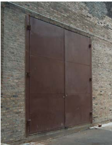
12' x 12' STC 50 Exterior Door, Oriental Theater Chicago, IL