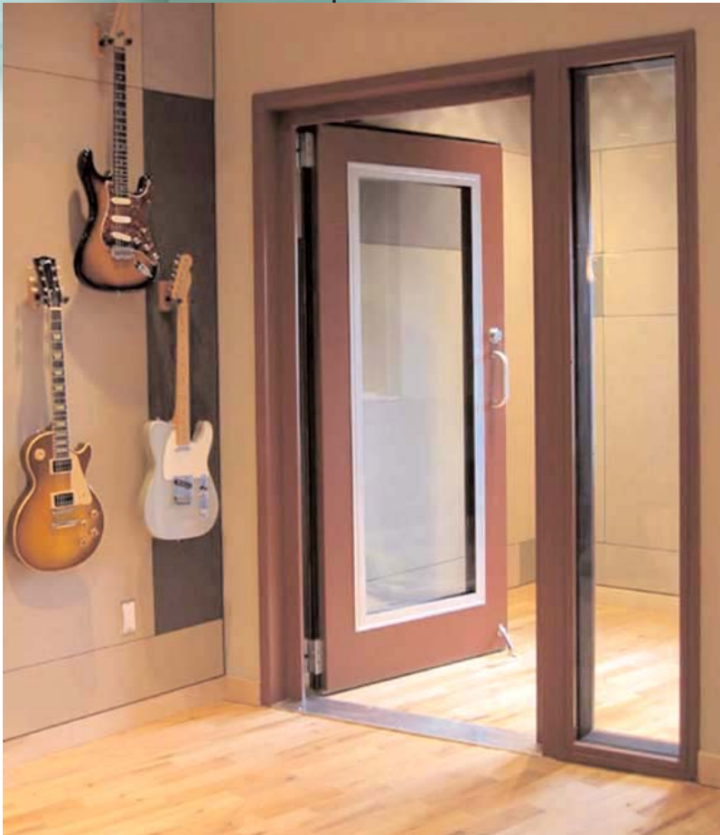
ABOVE: 3' x 7' STC45 Door with Acoustical Site Lite, Addison, TX