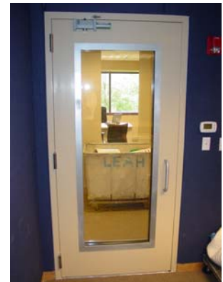
3' x 7' STC 50 Door, Boston, MA