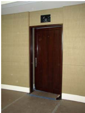
3' x 7' STC 50 Wood Veneer Door, Chicago, IL