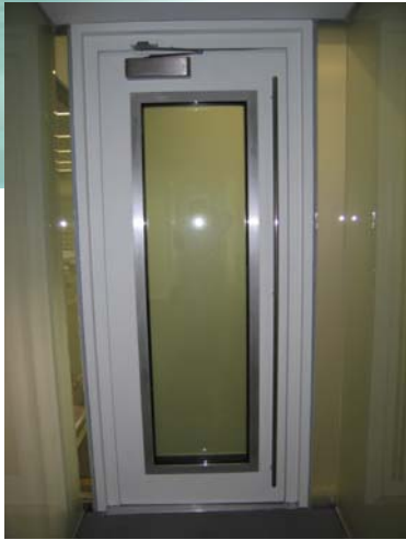
3' x 7'-6" STC 52 Single-Leaf Door fully glazed. New York, NY