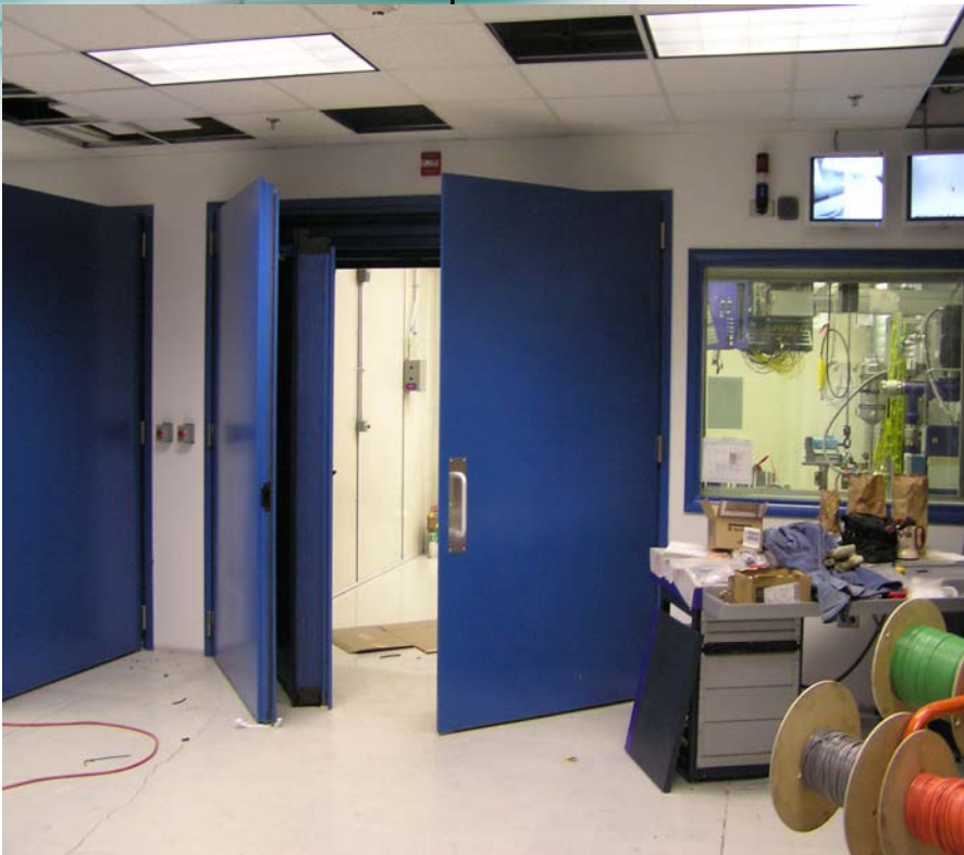
8' x 8' STC 48 Double-Leaf Door piggy-backed onto larger STC 60, fire rated, projectile rated, blast rated door—paired with an STC 62, projectile and blast resistant 4' x 8' window system. Wixom, MI