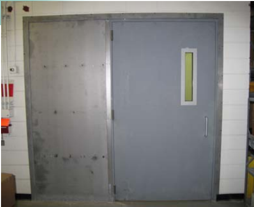
4' x 8' STC 50 Single-Leaf Door with 4" x 25" ADA window and 3' x 8' filler panel. Fond du Lac, WI