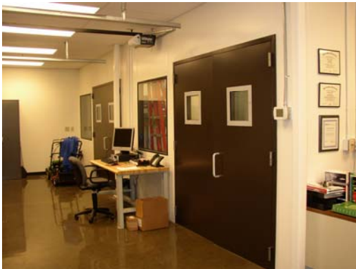
6' x 7' STC 52 Double-Leaf Door with 12" x 12" double glazed windows. New York, NY

NoiseBarriers, LLC. is your turnkey provider for all sound control door needs.